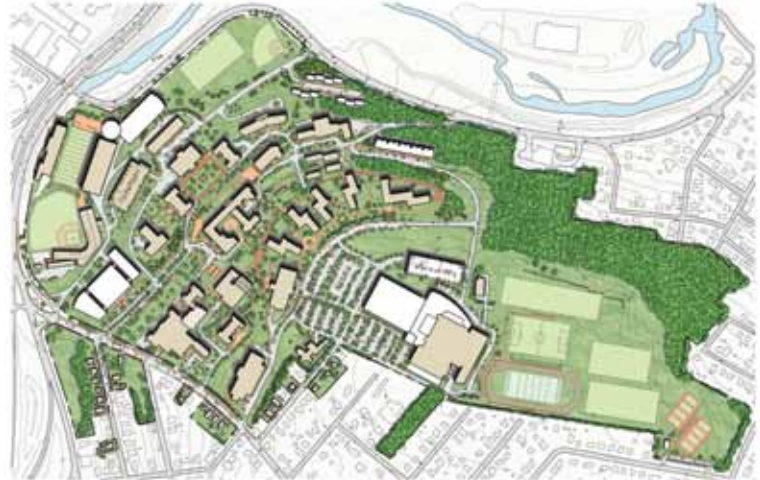
ILLUSTRATIVE PLAN 2007

In 2001 DOBER LIDSKY MATHEY (DLM) was retained by Holy Cross to study residential life. Subsequently, apartment housing for 200 students was constructed. In 2006, DLM returned to the College to develop a Campus Plan. The major agenda items related to site improvements as well as additional space for academic, administrative, athletics and recreation, and student life use. The project was led by DLM with SPORTS PLAN Studio contributing to the athletic and recreation part of the study and Carol R. Johnson Associates to the landscape piece.