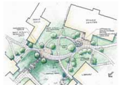
LANDSCAPE SKETCH CAROL R. JOHNSON ASSOCIATES

Housing for up to 300 students will be built in both residence hall and apartment formats. The existing athletics complex will be expanded and renovated, and a football practice facility will be built near the existing stadium. The existing field house will be renovated for recreational activities. The Campus Plan reserves a site at the formal entrance to campus for a Performing and Fine Arts Center. With these improvements space can be reassigned to meet other academic and administrative facility needs.