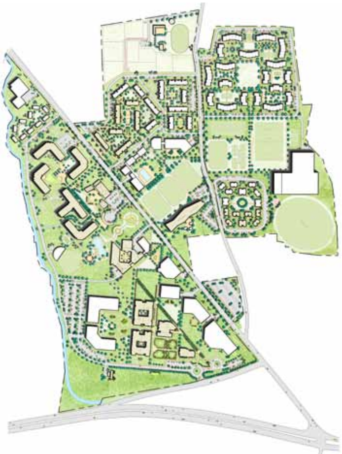
ILLUSTRATIVE CAMPUS PLAN