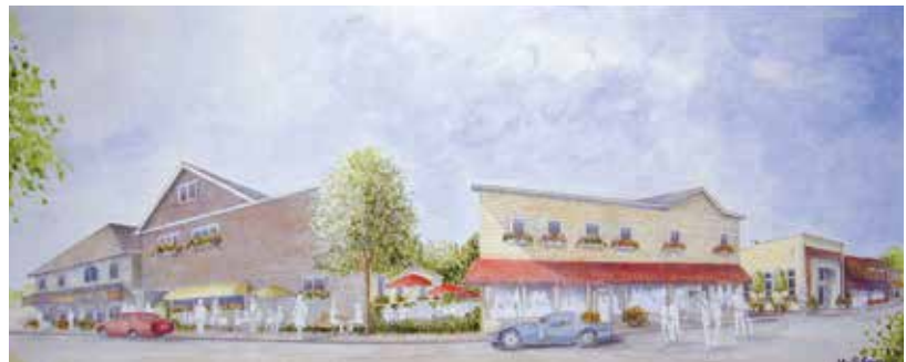
CONCEPT DRAWING HOW THE DOWNTOWN COULD BE REVITALIZED